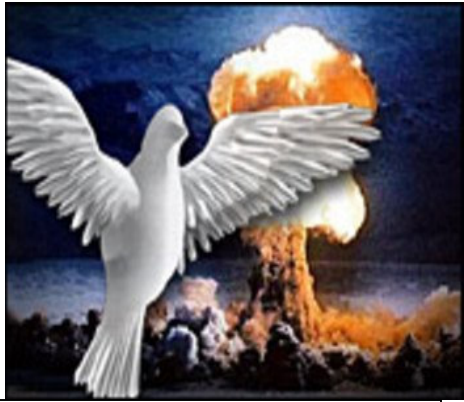
Ending the nuclear nightmare